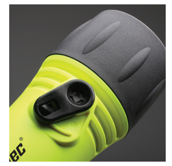
POWERFUL SINGLE MAXBRIGHT LED